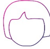
Photo coming soon